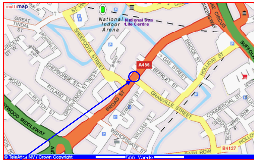
Novotel Birmingham Centre Hotel